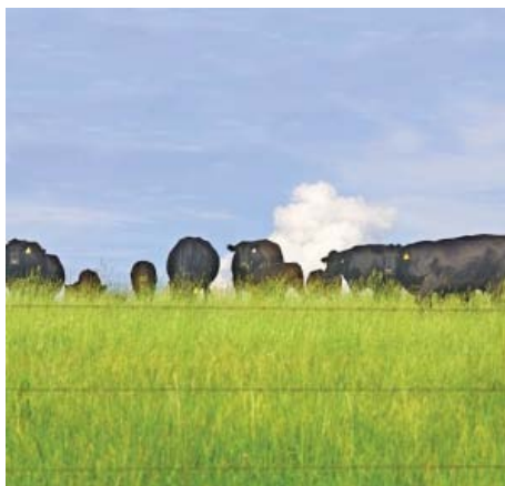
MOBILE MEAT HARVESTER - A $150,000 Mobile Meat Harvesting Unit equipped for the on-farm harvest of beef, sheep, goats, buffalo and hogs is now available to local ranchers.

The MHU, a 28-foot long trailer powered by a generator, is the first of its kind in California and harkens back to a time when all meat was raised, butchered, and sold by ranchers directly to the local consumer.